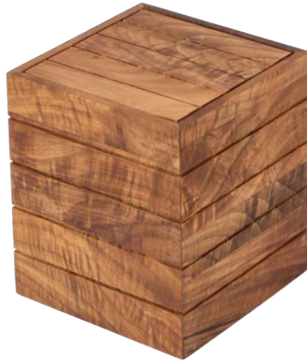
Box Riser – Medium

Material: Walnut, Oiled Dimensions: 15 x 15 x H 15 cm