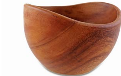
Acacia Wood Bowl

Material: Acacia, Oiled Dimensions: Ø28.5 x H 10 cm