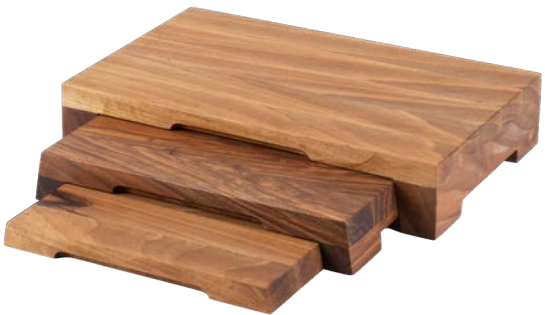
Rectangular Step Riser

Dimensions: 26 x 25 x H 3 cm Dimensions: 32 x 25 x H 6 cm Dimensions: 40 x 25 x H 9 cm