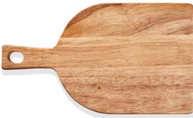
Rectangular Board with Handle-10

Material: Walnut, Oiled Dimensions: 40 x 20 x H 1.6 cm