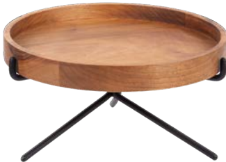
Trio Leg Stand - Small