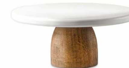
White Walnut Cake Stand – Large