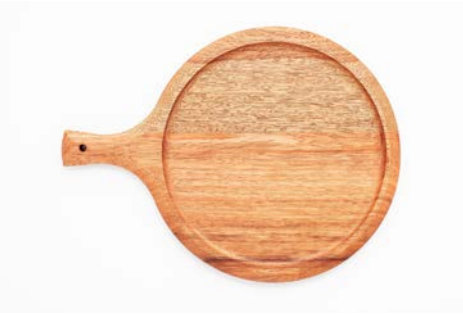
Round Board with Handle-03

Material: Walnut, Oiled Dimensions: 32 x 20 x H 3 cm