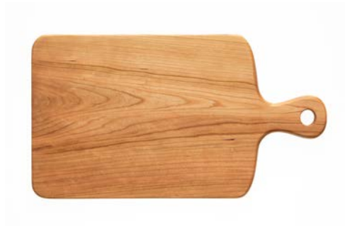
Rectangular Board with Handle-07