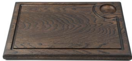
Rectangular Board - Walnut

CODE: 13108-02 Material: Oak, Oiled Dimensions: 39 x 28 x H 2 cm