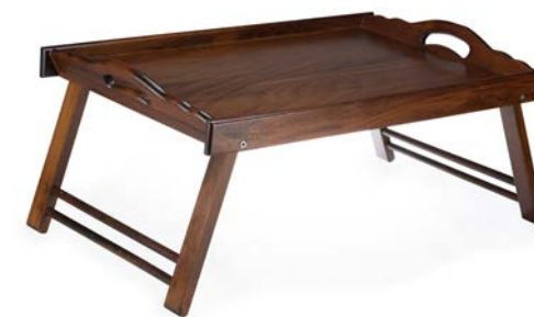
Classic Folding Room Tray

Material: Oak, Lacquered Dimensions: 66 x 47.5 x H 78.5 cm