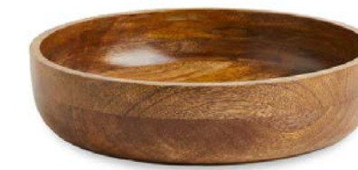
Acacia Wood Bowl