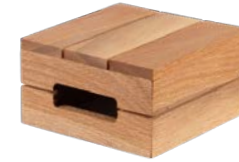
Crate Riser – Small

Material: Walnut, Oiled Dimensions: 20 x 20 x H 20 cm