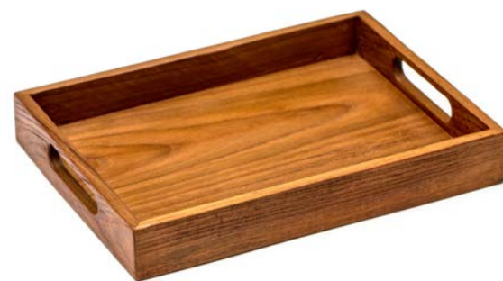
Rectangular Service Tray with Handle - Large