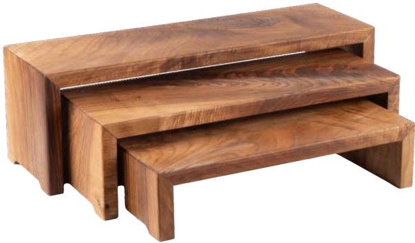
Three Step Riser