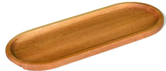
Oval Cicchetti Board