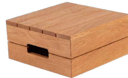
Crate Riser – Large

Material: Oak, Oiled Dimensions: 20 x 20 x H 10.5 cm