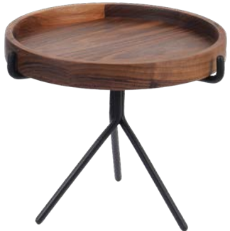
Trio Leg Stand - Large