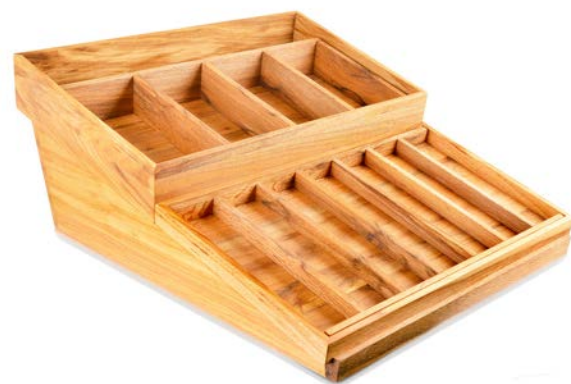
Buffet Display Stand – Segment