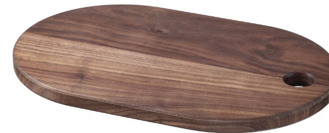
Oval Cicchetti Board - Walnut