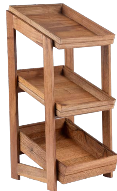
3-Tier Stand GN 1/2