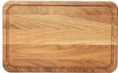
Rectangular Board - Medium

CODE: 13108-02 Material: Oak, Oiled Dimensions: 39 x 28 x H 2 cm