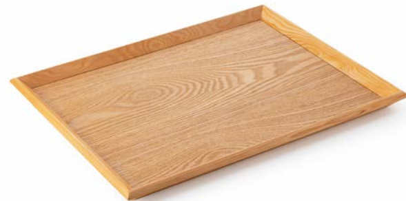
Rectangular Service Tray - Large