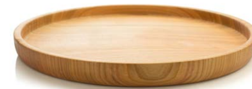
Round Service Tray – Small