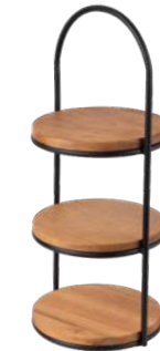
Oak Afternoon Tea Stand