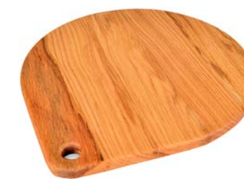
Waterdrop Cicchetti Board - Large