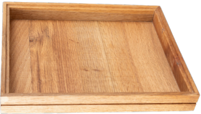
Stand Tray Low GN 1/2