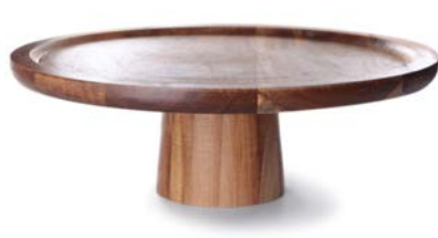
Walnut Cake Stand-02

Material: Walnut, Oiled Dimensions: Ø30 x H 11 cm