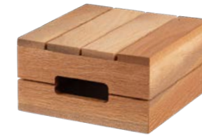
Crate Riser – Medium

Material: Oak, Oiled Dimensions: 16.5 x 16.5 x H 9 cm