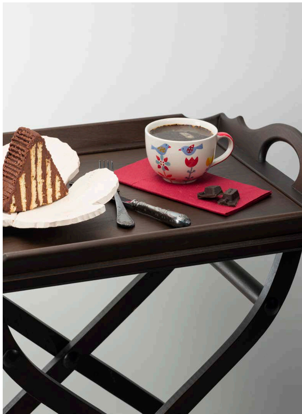
Classic Butler Tray with Stand