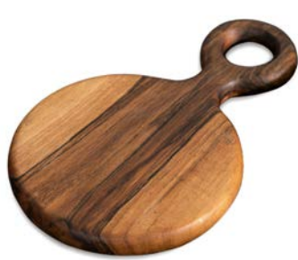
Round Board with Handle - Small