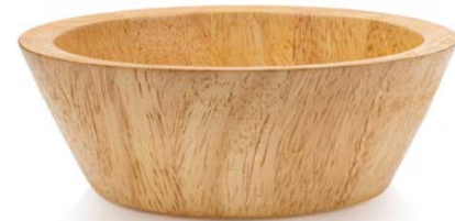
Acacia Wood Bowl

Material: Acacia, Oiled Dimensions: Ø15 x H 12 cm