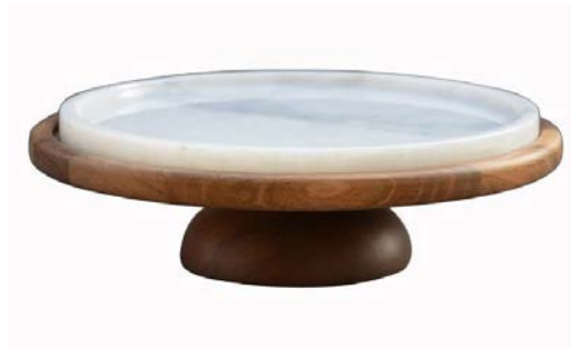
White Marble Cake Stand