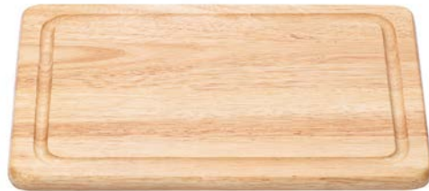
Rectangular Board - Large

CODE:13108-04 Material: Oak, Oiled Dimensions: 35 x 28 x H 2 cm