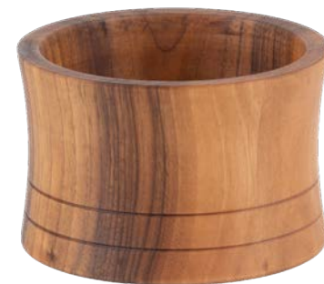
Concave Bowl – Medium