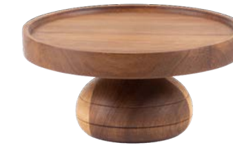
Cake Stand – Small