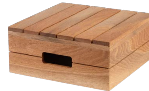
Crate Riser – Extra Large

Material: Oak, Oiled Dimensions: 25 x 25 x H 11.5 cm