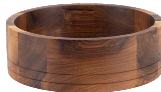
Straight Bowl - Large