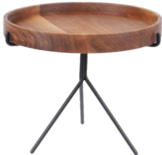
Trio Leg Stand - Medium