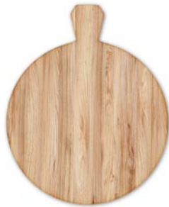
Round Board with Handle-05

Material: Oak, Oiled Dimensions: 40 x 30 x H 1.6 cm