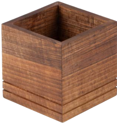
Buffet Basket – Small