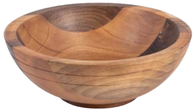
Buffet Bowl – Small