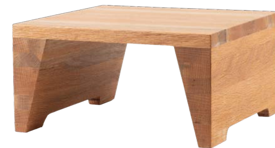
Block Riser – Large