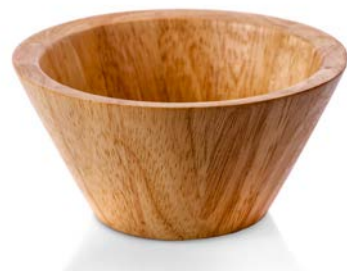
Acacia Wood Bowl

Material: Acacia, Oiled Dimensions: Ø15 x H 9 cm