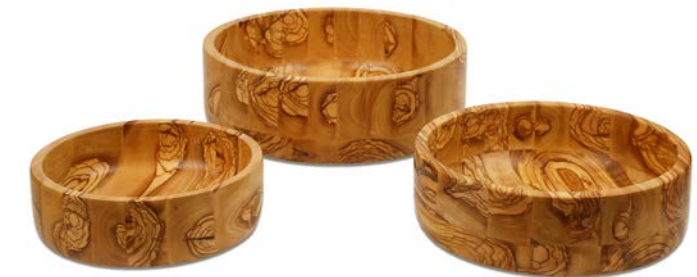
Olive Wood Bowl Set of 3