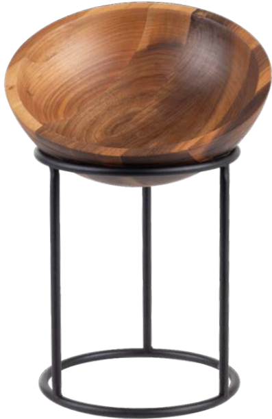
Buffet Stand - Large

Compatible with 13095-01, 13095-02, 13095-03