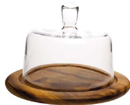
Dessert Cheese Dome-02

Material: Oak, Oiled Dimensions: Ø24 x H 16 cm