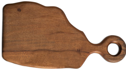
Rustic Edged Board with Handle

Material: Walnut, Oiled Dimensions: 32 x 28 x H 1.6 cm