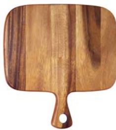
Rectangular Board with Handle-08

Material: Dark Oak, Oiled Dimensions: 40 x 20 x H 1.6 cm