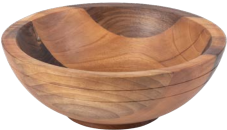
Buffet Bowl – Medium

Compatible with 13100-04, 13100-05, 13100-06, 13100-07