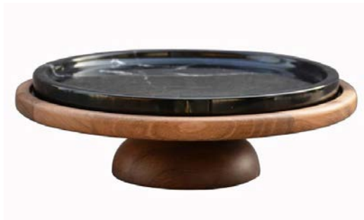
Black Marble Cake Stand

Material: Walnut, Oiled & Marble Dimensions: Ø30 x Ø27 x H 9 cm