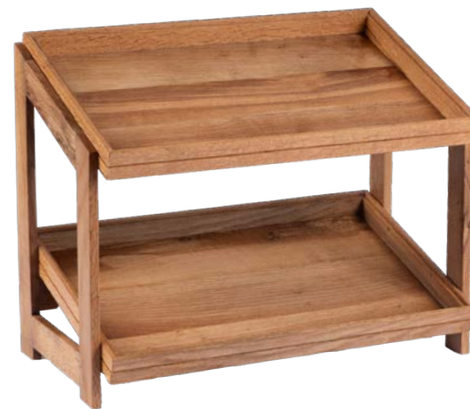
2-Tier Stand GN 1/1