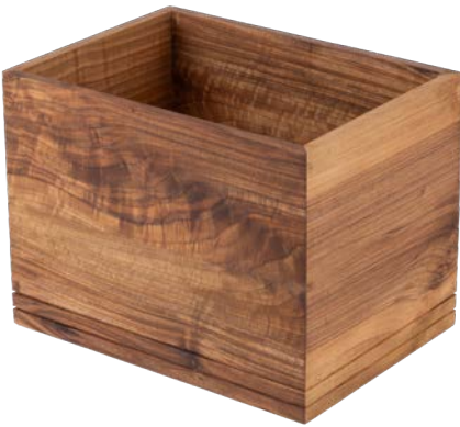
Buffet Basket – Large

Material: Walnut, Oiled Dimensions: 34 x 26 x H 17.5 cm