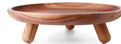
Walnut Round Riser – Small