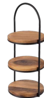
Walnut Afternoon Tea Stand