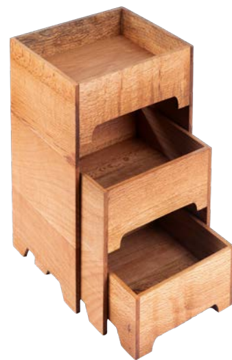
3-Layer Stand – Small

Dimensions: Upper Layer: 28 x 28 x H 22 cm Middle Layer: 24 x 28 x H 14 cm Lower Layer: 20 x 28 x H 6 cm