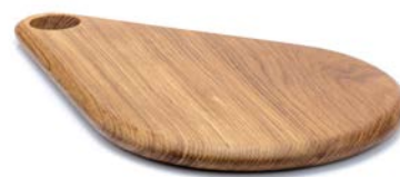
Waterdrop Cicchetti Board - Small