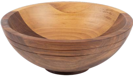
Buffet Bowl – Large

Compatible with 13100-04, 13100-05, 13100-06, 13100-07