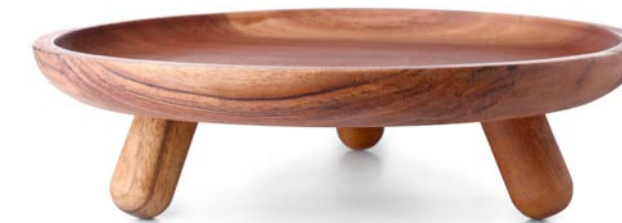
Walnut Round Riser – Large