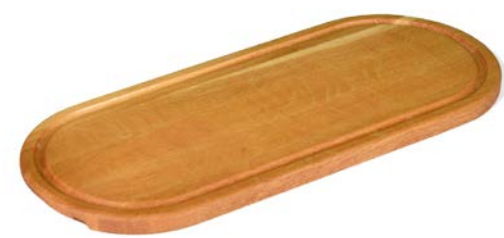
Oval Cicchetti Presentation Board