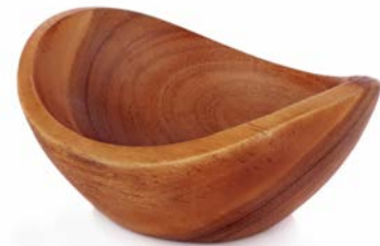
Acacia Wood Bowl