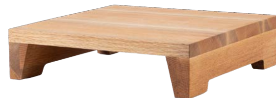
Block Riser – Small