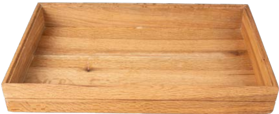
Stand Tray High GN 1/1

CODE: 13098-03 Material: Oak, Oiled Dimensions: 53 x 32.5 x H 4.5 cm Compatible with 13101-02, 13101-04, 13101-06