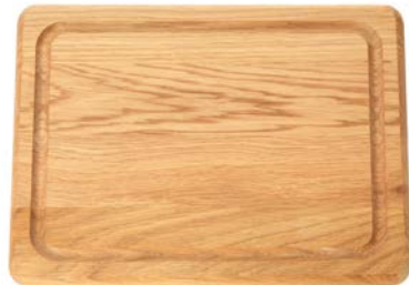
Rectangular Board - Small

CODE: 13108-03 Material: Walnut, Oiled Dimensions: 35 x 25 x H 2 cm