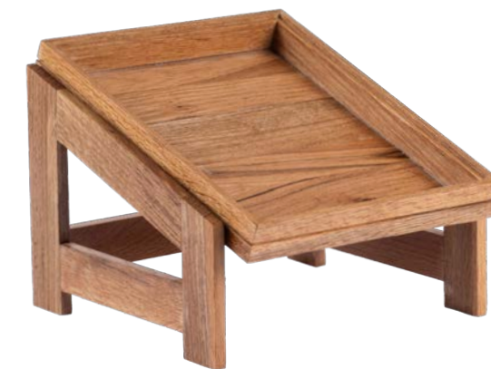
1-Tier Stand GN 1/2