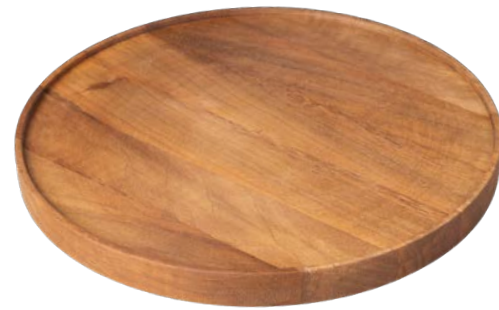
Buffet Plinth – Walnut

Whether displaying desserts or other delicious edibles, our buffet plinths combine attractive aesthetics with straightforward ease of access.