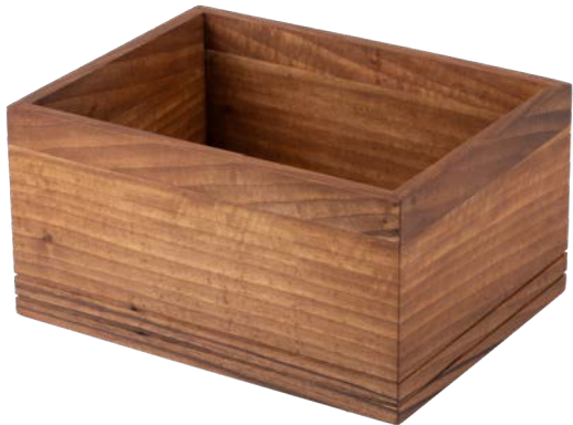
Buffet Basket – Medium

Material: Walnut, Oiled Dimensions: 15 x 15 x H 15 cm