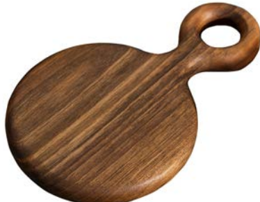
Round Board with Handle - Large

Material: Walnut, Oiled Dimensions: 27 x 17 x H 3 cm