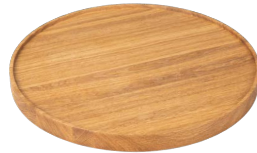
Buffet Plinth – Oak

Compatible with 13100-04, 13100-05, 13100-06, 13100-07