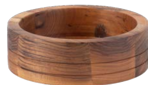
Straight Bowl - Small