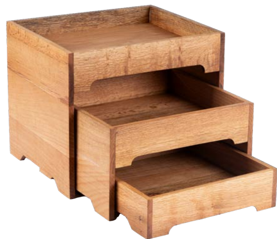
3-Layer Stand – Large