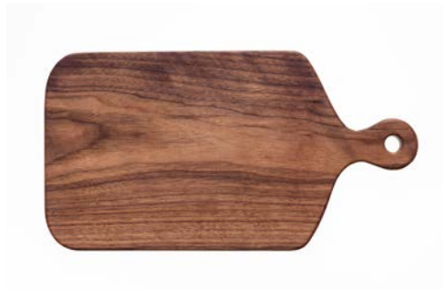
Rectangular Board with Handle-09

CODE: 13107-10 Material: Walnut, Oiled Dimensions: 38 x 20 x H 2 cm