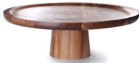
Walnut Cake Stand-01

Material: Walnut, Oiled & Marble Dimensions: Ø30 x Ø27 x H 9 cm