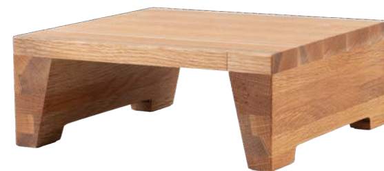
Block Riser – Medium