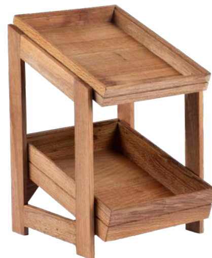
2-Tier Stand GN 1/2