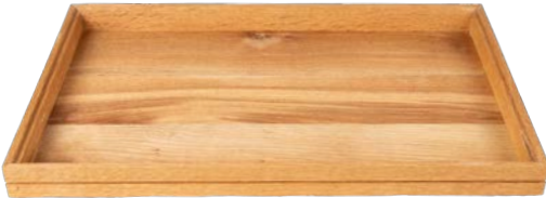
Stand Tray Low GN 1/1

Material: Oak, Oiled Dimensions: 26.5 x 32.5 x H 7.5 cm Compatible with 13101-01, 13101-03, 13101-05