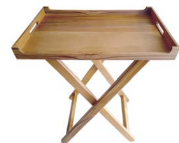
Modern Butler Tray with Stand

Material: Walnut, Lacquered Dimensions: 37.5 x 49 x H 55cm