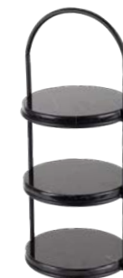
Black Afternoon Tea Stand