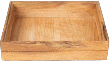
Stand Tray High GN 1/2

Material: Oak, Oiled Dimensions: 26.5 x 32.5 x H 4.5 cm Compatible with 13101-01, 13101-03, 13101-05