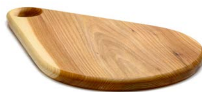
Waterdrop Cicchetti Board - Medium