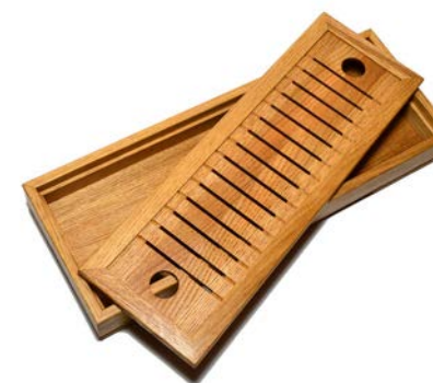
Rectangular Tea Tray