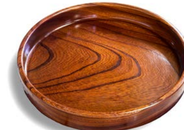
Round Service Tray – Large

Material: Walnut, Lacquered Dimensions: Ø20 x H 4.5 cm