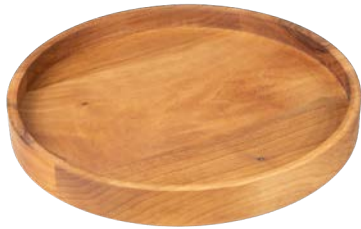
Buffet Platter – Small