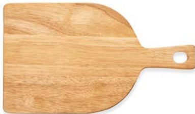
Rectangular Board with Handle-11

Material: Walnut, Oiled Dimensions: 35 x 20 x H 1.6 cm