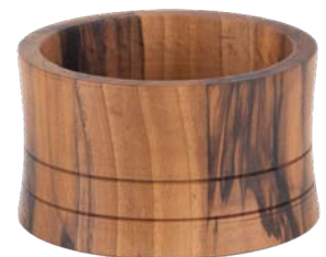
Concave Bowl – Small