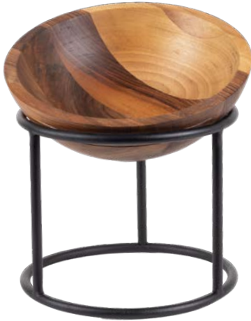
Buffet Stand - Medium

Compatible with 13095-01, 13095-02, 13095-03