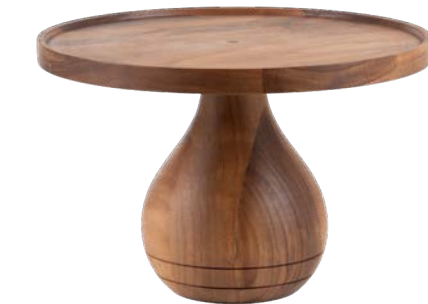
Cake Stand – Large