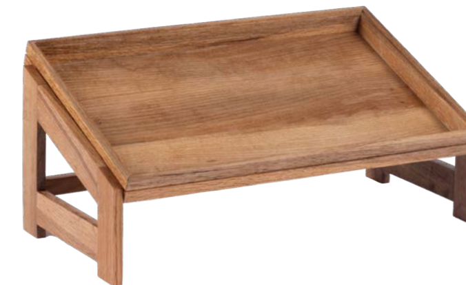
1-Tier Stand GN 1/1