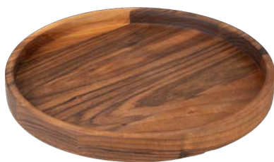
Buffet Platter – Medium