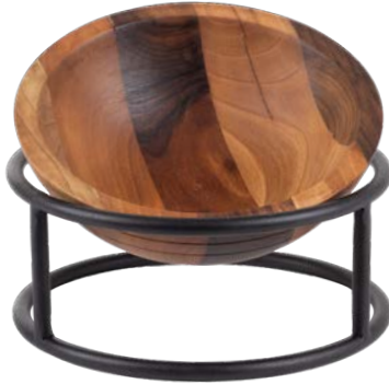
Buffet Stand - Small