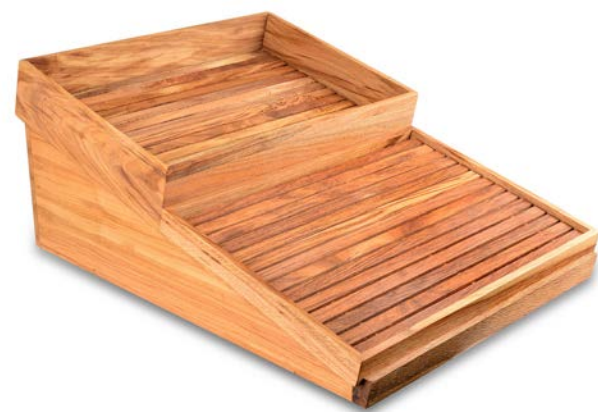
Buffet Display Stand – Slatted