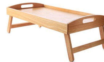
Modern Folding Room Tray

Material: Walnut, Lacquered Dimensions: 35 x 54.5 x H 29 cm