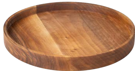
Buffet Platter – Large