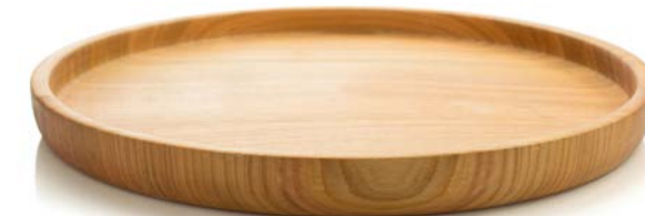
Round Service Tray – Large

Material: Oak, Oiled Dimensions: Ø20 x H 3.5 cm