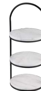
White Afternoon Tea Stand