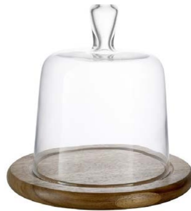
Dessert Cheese Dome-03

Material: Walnut, Oiled Dimensions: Ø28 x H 21 cm