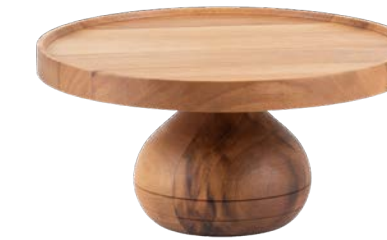
Cake Stand – Medium