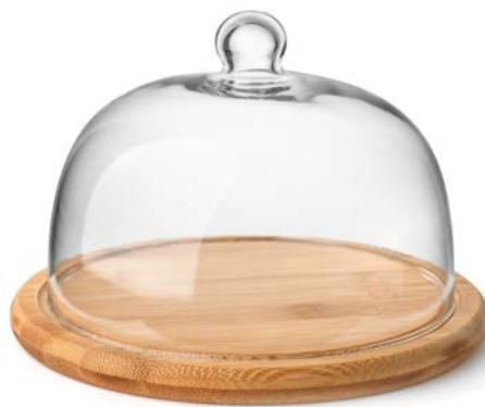
Dessert Cheese Dome-01