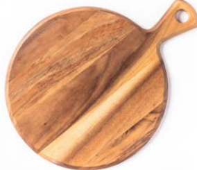
Round Board with Handle-04

Material: Oak, Oiled Dimensions: 40 x 30 x H 2.5 cm