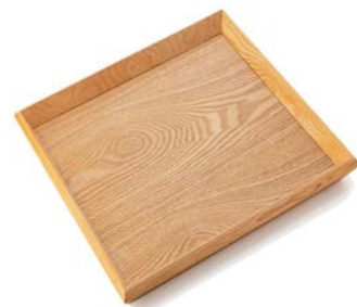
Square Service Tray