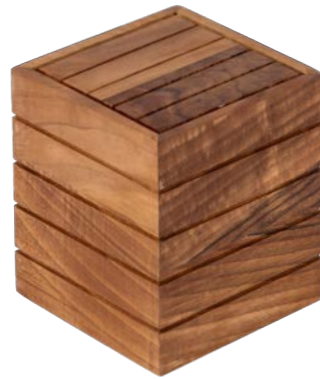
Box Riser – Small