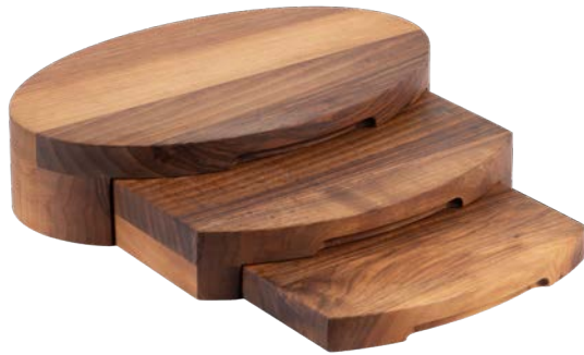
Oval Step Riser

Dimensions: 42 x 18 x H 10 cm Dimensions: 49 x 18 x H 14 cm Dimensions: 56 x 18 x H 18 cm