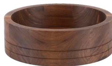
Straight Bowl - Medium